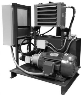
NEMA 4 Rated Enclosures