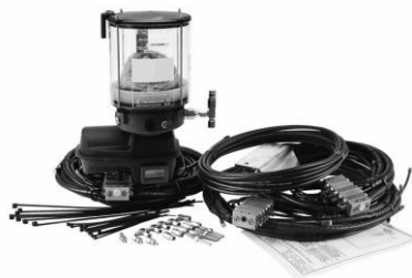
Automatic Lubrication System