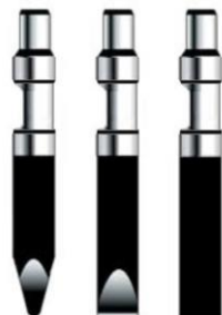
MOIL CHISEL BLUNT